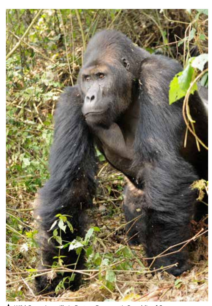
▲ Wild Grauer's gorilla in Eastern Democratic Republic of Congo