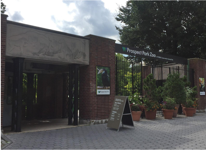
Flatbush avenue entrance

There are two entrances to the zoo and we will walk through one of them. This is what they look like.