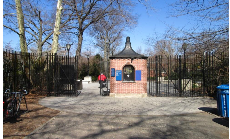
Children's Corner Entrance *this entrance is wheelchair and stroller accessible