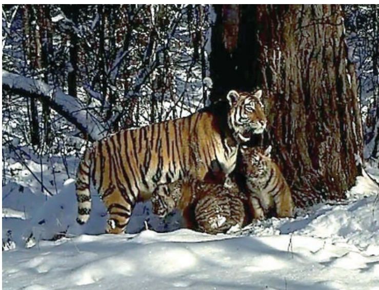
ZOLUSHKA STANDING UNDER A HUGE KOREAN PINE TREE WITH TWO SMALL CUBS HUDDLED BENEATH HER.

There is no greater feeling than coming home. But for our friends in the wild, home can be an uncertainty due to threats like development, poaching, and other human activities. WCS is committed to protecting critical habitat for vulnerable species. The following stories demonstrate some of the ways we re-establish wildlife populations in their historic ranges.