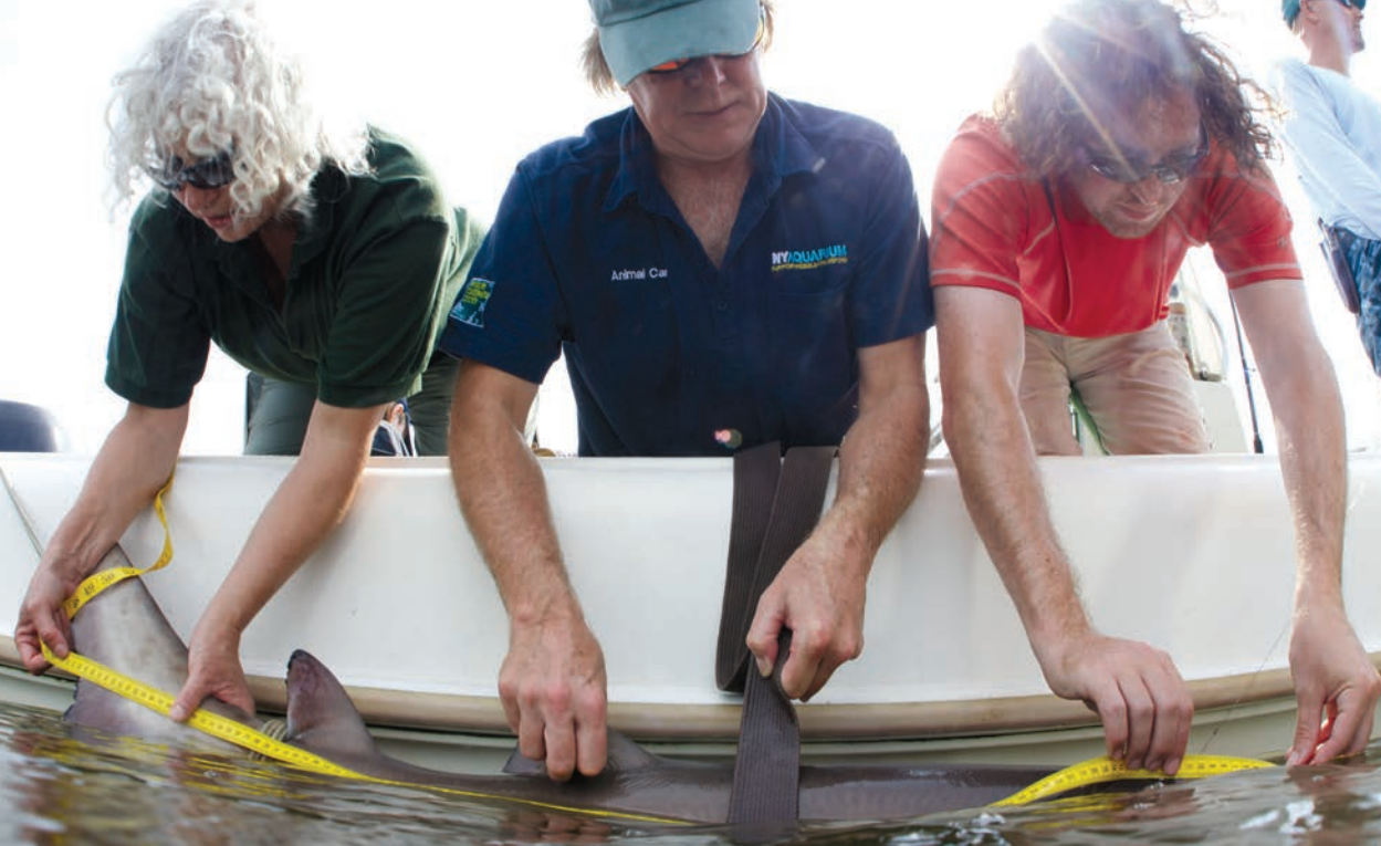
RESEARCHERS FROM THE AQUARIUM'S NY SEASCAPE PROGRAM TAGGED TEN NEW SAND TIGER SHARKS IN 2015.